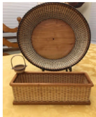
Cindy's Beautiful Ebony Tray, Trisket Tray and mini Easter Basket