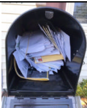
Susie's Mailbox on September 4 th !