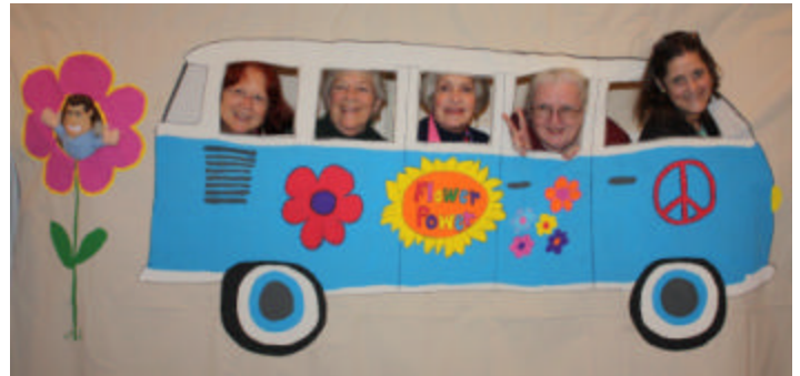
"The weavers on the bus go in and out..."