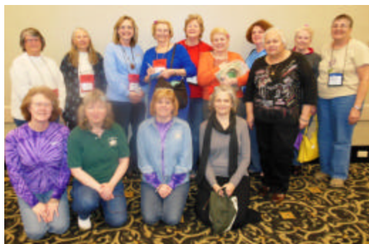
Many of the TBG attendees at the 2014 NCBA convention

March also brought us the NCBA 2014 Convention. As I walked around and sat at the Saturday night meeting, I took a few notes... TBG members won Volunteer raffles, ribbons and a scholarship. 42 TBG members were in attendance. 13 raffles were won by 8 members.